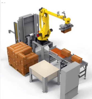
Robotic Palletizing Solution with Partition