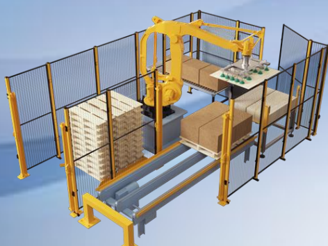
Multi-Tasking – Palletizing, Pallet Handling, Partition Handling – All by One robot