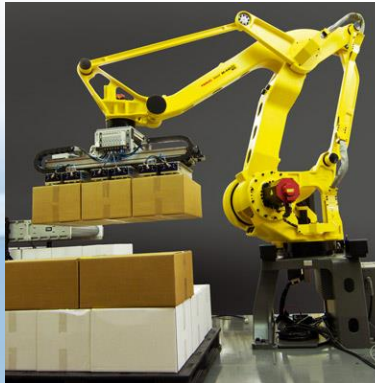
Palletizing - Multi box handling