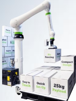
Cobotic Palletizing Solution