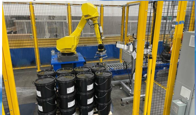
Palletizing Solution for Oil, Paint, Grease Containers