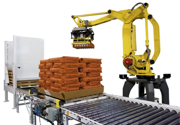
Palletizing Solution with Automatic Pallet Dispenser