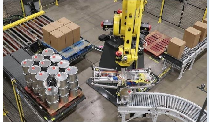
Robotic Mixed Case Palletizing System